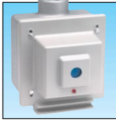
PHOTO CONTROL Page 1737