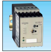
CONTACT PROTECTION RELAY Page 1722