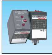
MOTOR DUPLEXOR Pages 1721, 1728-1729