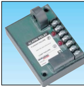
FLASHER & BEACON ALARM RELAYS Pages 1734-1736