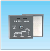
BEACON TOWER FLASHERS Pages 1733-1734