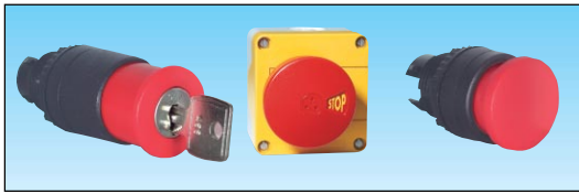
EMERGENCY STOP PUSHBUTTONS & ASSEMBLIES Pages 1758-1761