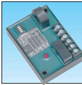
OBSTRUCTION LAMP ALARM RELAY Page 1736