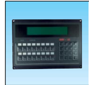
MAN MACHINE INTERFACES Pages 1585-1589