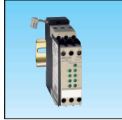
DIGITAL I/O Pages 1546-1549