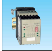
ANALOG I/O Pages 1550-1555