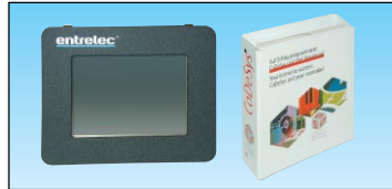
HARDWARE/SOFTWARE Pages 1540-1541