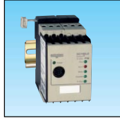
CPU S 200, S 250 Pages 1530-1533, 1542-1543