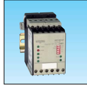
ADDITIONAL PROCESS & CONTROL MODULES Pages 1556-1561