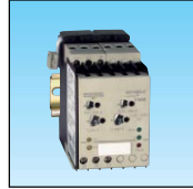
MEASURING & MONITORING INTERFACE MODULES Pages 1562-1565