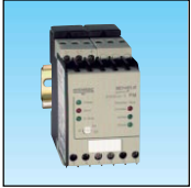
BUS MODULES Pages 1502-1518, 1534-1535