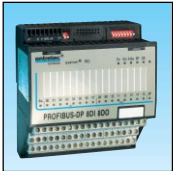
BUS MODULES, RIO Pages 1572-1576