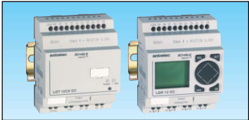
RELAY OR TRANSISTOR OUTPUTS Pages 1521-1529