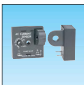
AC CURRENT SENSOR, PLC INTERFACE Page 1490