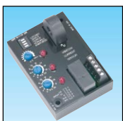
WINDOW CURRENT SENSOR Pages 1488-1489