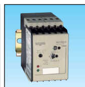
INSULATION RESISTANCE MONITORS Pages 1494-1495