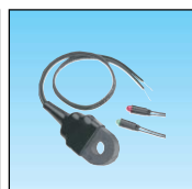
AC CURRENT INDICATOR Page 1493