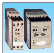
CURRENT MONITORING RELAYS Pages 1484-1497